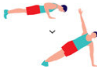
11. Push-up and rotation