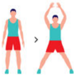
1. Jumping jacks