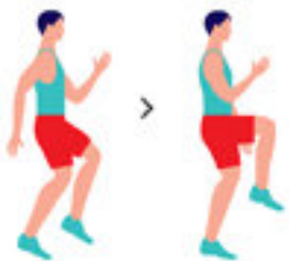
9. High knees running in place